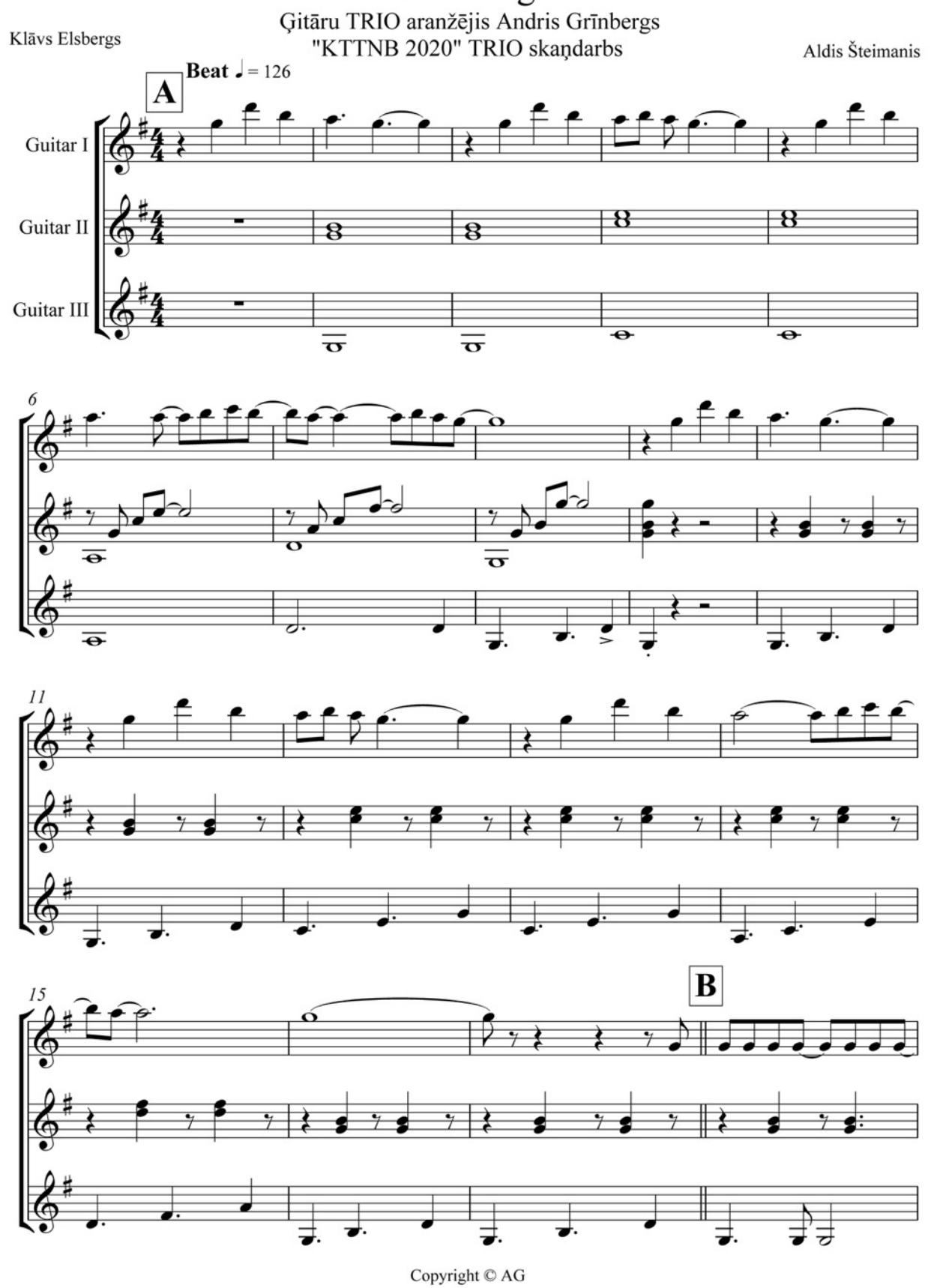
18 of 24